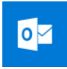
Outlook (Online only)