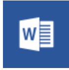
Word (Online only)